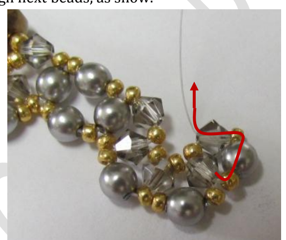
Step 51 Continue without any new beads through next beads, as show.

Step 50 Continue without any new beads through next beads, as show.