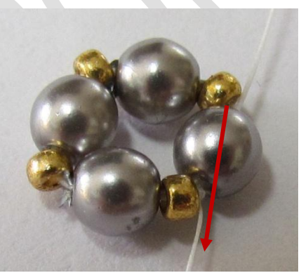
Step 3 Pick up 1xR11, 1xSW4, 2xR11, 1xSW4, 1xR11. Go through the same pearl that you began this step but from the back as show.