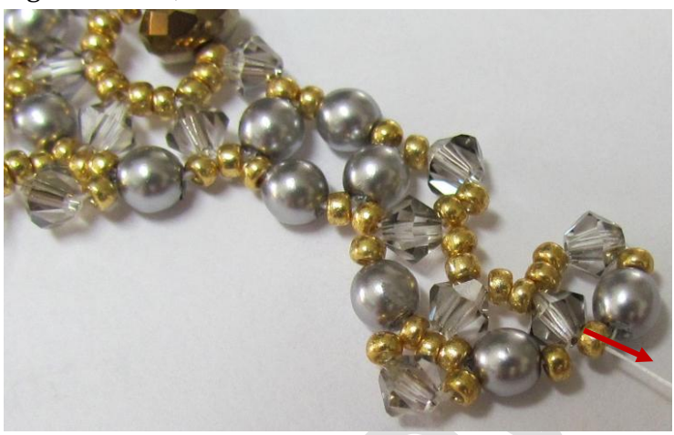
Step 33 Continue without any new beads through next R11, as show.