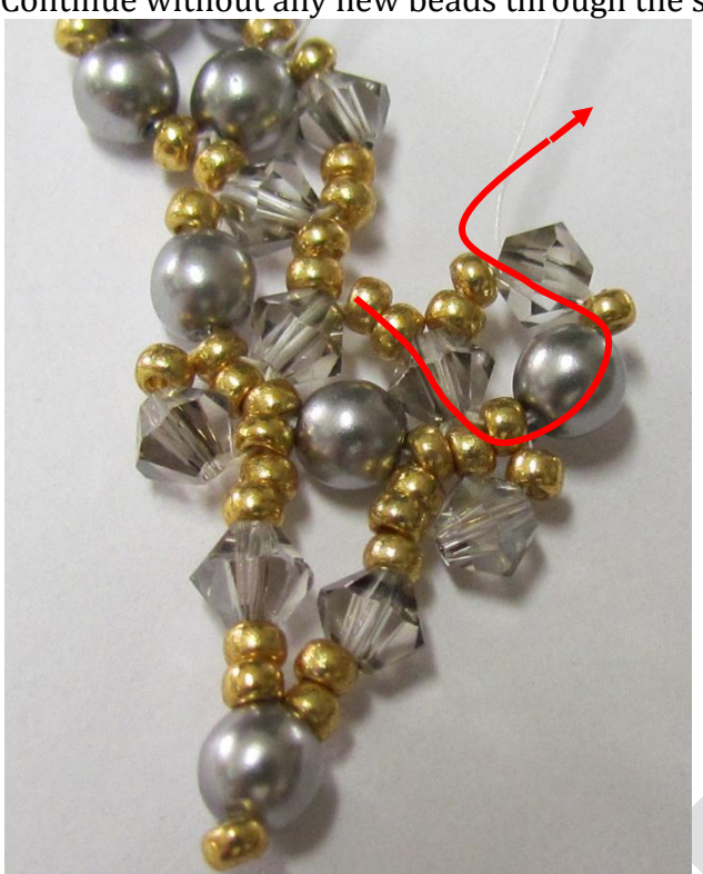
Step 18 Pick up 2xR11, 1xSW4, 1xR11, 1xPRL4, 1xR11 and go through the SW4 that you are located now but from the back, as show.