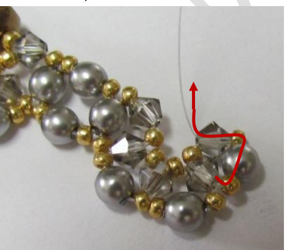
Step 51 Continue without any new beads through next beads, as show.