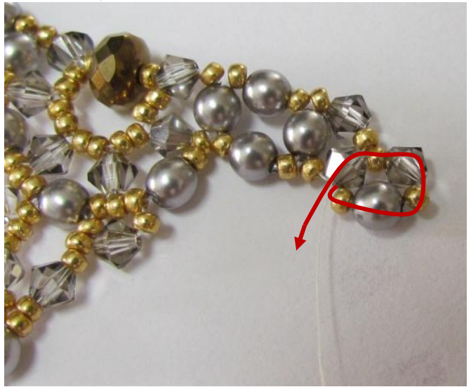
Step 47 Continue without any new beads through next beads, as show