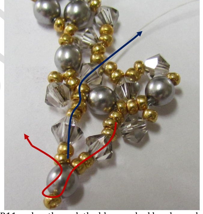
Pick up 2xR11, 1xSW4, 2xR11 and go through the blue marked beads, as show above.

Pick up 2xR11, 1xSW4, 2xR11, 1xPRL, 1xR11, as show. Skip the last R11 that you just added and go back through the PRL4, as show (red line).