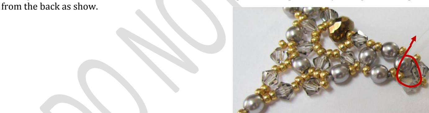
Step 45 Continue without any new beads through next beads, as show.

Pick up 1xR11, 1xSW4, 1xR11, 1xSW4, 1xR11. Go through the same pearl that you began this step but