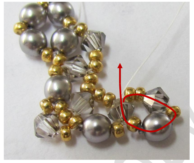
Step 12 Continue without any new beads through the beads, as show.