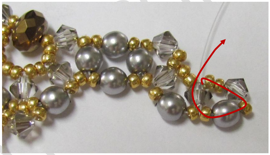
Step 28 Continue without any new beads through next beads, as show.