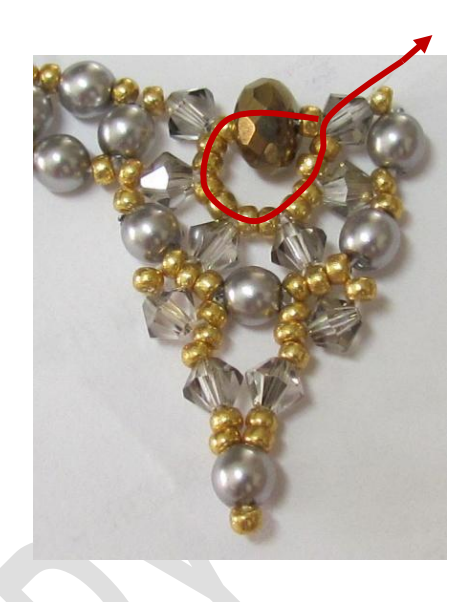
Step 42 Continue without any new beads through next beads, as show.