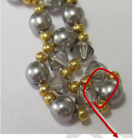
Step 50 Continue without any new beads through next beads, as show.