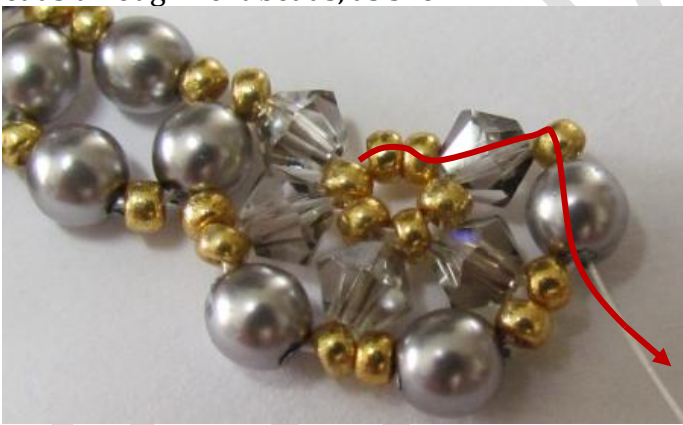
Step 60 Repeat from step 43 to step 53 until you rich the desire length. You should do steps 43 o step 53 from the other side of the necklace too.