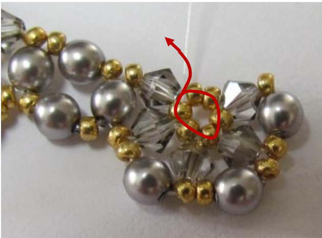
Step 53 Continue without any new beads through next beads, as show.

Pick up 2xR11. Go through the next beads, as show.