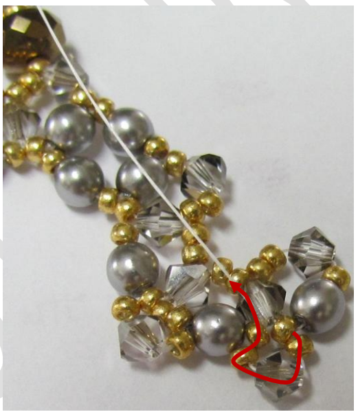
Step 35 Pick 1xR11 and continue without any new beads through next beads, as show.