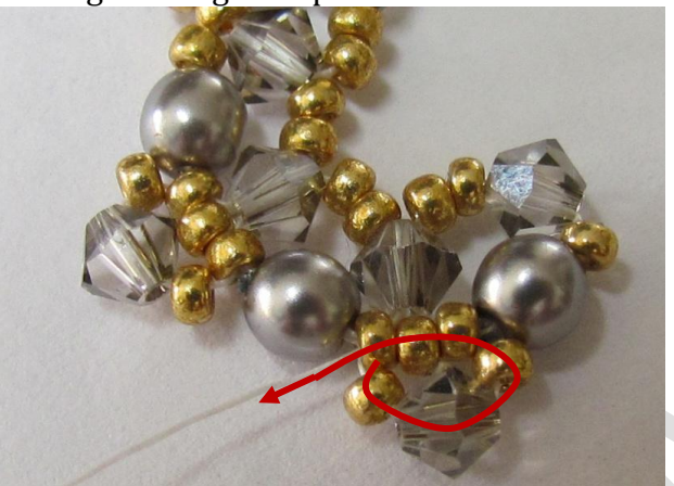
Step 15 Continue without any new beads through next R11, as show.

Pick up 1xR11, 1xSW4, 1xR11 and go through the previous 3xR11 beads but from the back, as show.