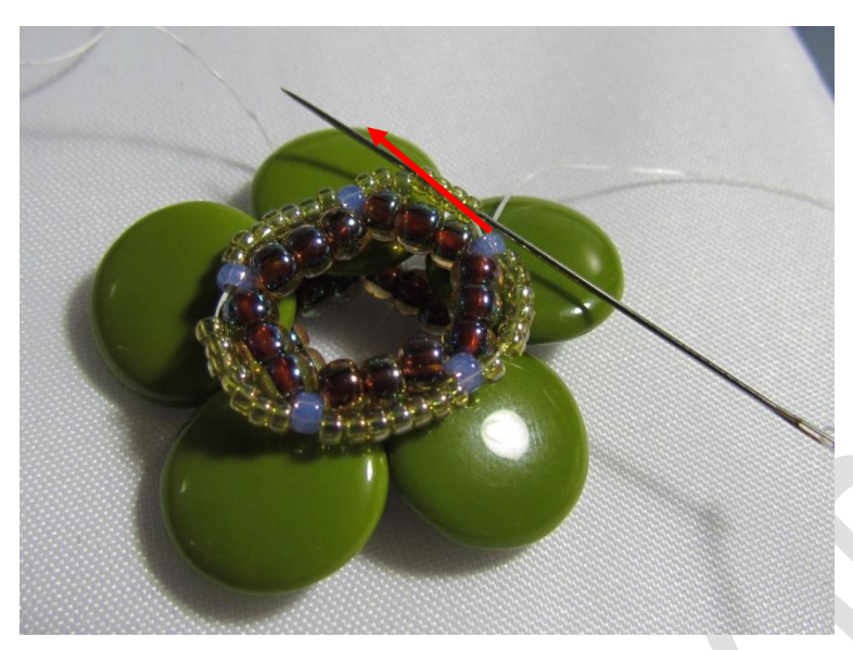
Step 13 Pick up 1x R11A and go through the next center 4^{th} x R15, as show (the middle ones).