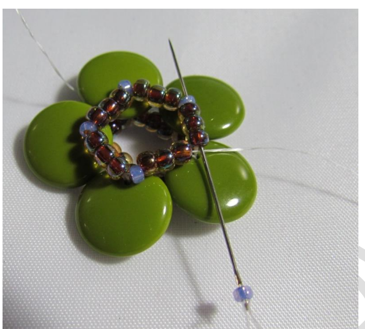
Step 11 Pick UP 7x R15 and go directly through the next R11A, as show.