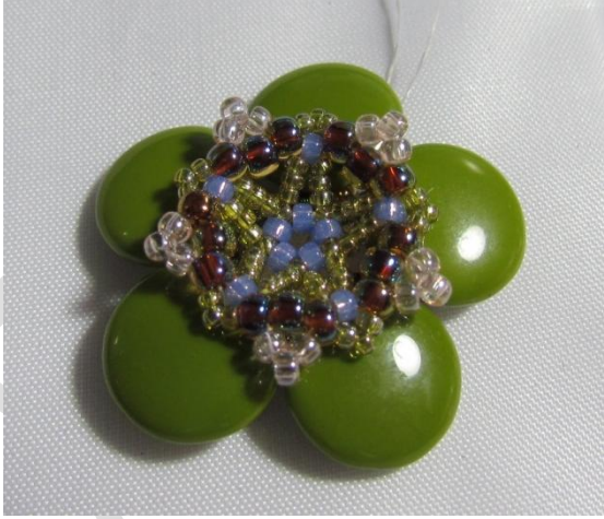
Step 19 Cross through the beads to the other side, and then go through 3x R8 beads, as show.