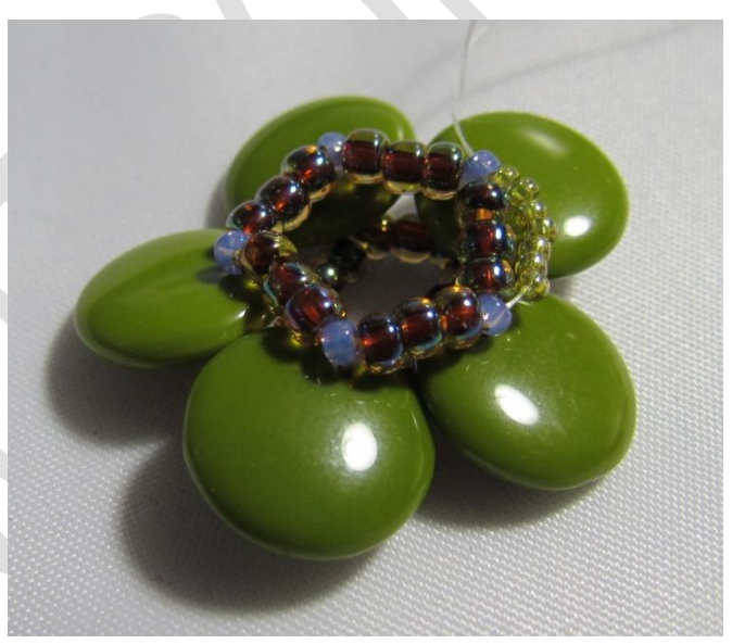
*** Repeat this step another 4 times, as show.