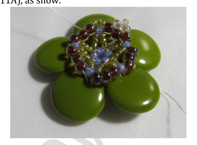
Step 18 Pick up 3x R15 and go through the next 1^{st} R8 (skip the R11A), as show.